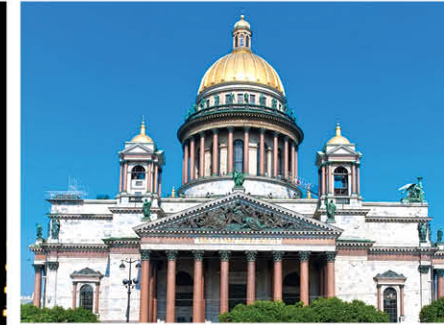
St. Isaac's Cathedral, 500 meters

Shatush's Asian-European mixed menu is based on the principles of healthy cooking, high-quality ingredients, and a creative approach to every dish