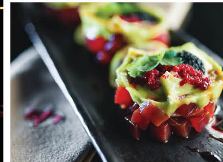
Bluefin tuna tartar with guacamole, R850